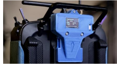
Fig. 3. Example of the transmitter assembly inserted into the Radiomaster TX16 remote control [2]

As illustrated in Figure 2, the ELRS transmitter integrates an ESP32 microcontroller with an SX1280 RF module, demonstrating a setup suitable for UAV control.