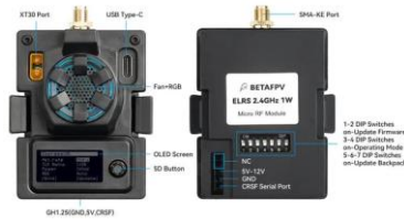
Fig. 2. ELRS transmitter from BetaFPV with ESP32 and SX1280 [3]

As illustrated in Figure 2, the ELRS transmitter integrates an ESP32 microcontroller with an SX1280 RF module, demonstrating a setup suitable for UAV control.