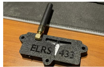
Fig. 4. Example of receiver assembly [2]